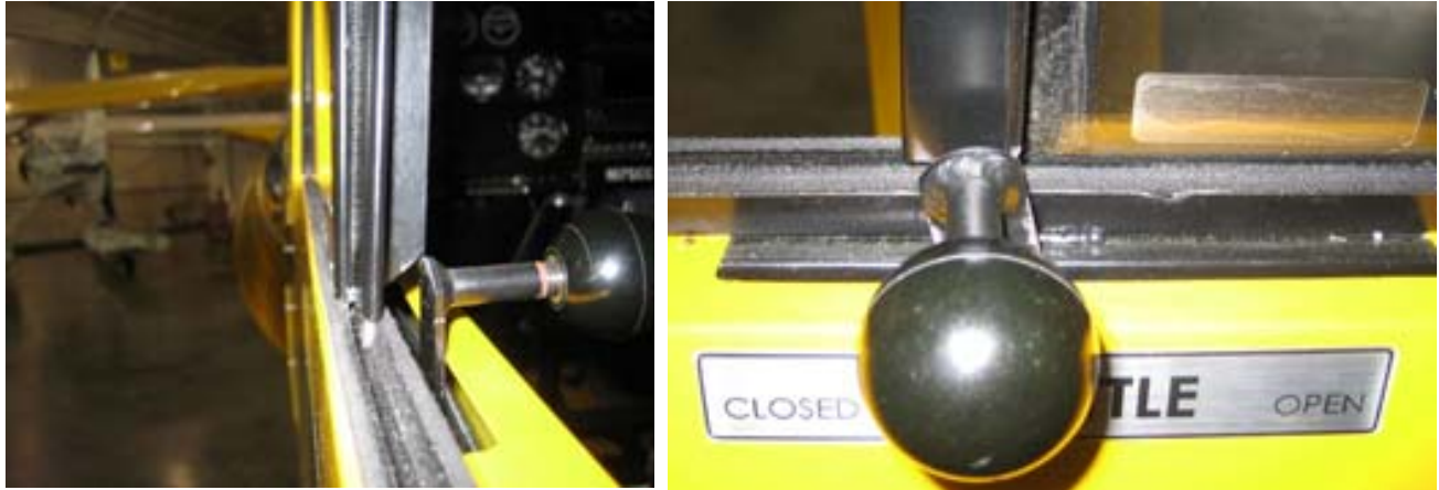
FIGURE 1 –Rear Window Handle Channel/Throttle lever interference

Cub Crafters, Inc. Considers Compliance Mandatory May 29, 2008 The parts of this Service Bulletin that change the Type Design of the aircraft have been approved by the FAA