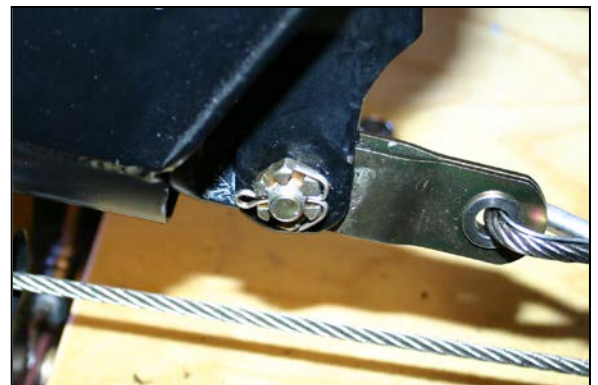
Figure 1 – Correct Cotter Pin Installation